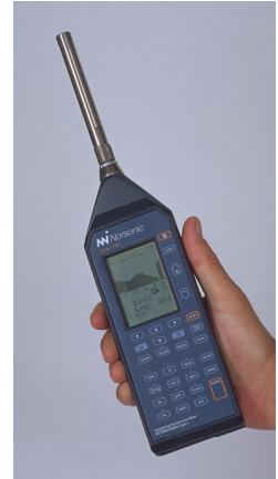
Figure 2: The STIPA method is implemented as a program option in the sound level meter Norsonic Nor118. Both STI- and CIS-value are presented, without and with a virtual background noise level.